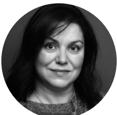
22 CARE SANTOS