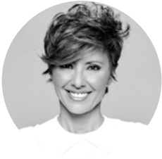
04 SONSOLES ÓNEGA