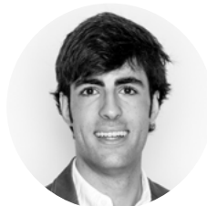
20 ALFONSO GOIZUETA